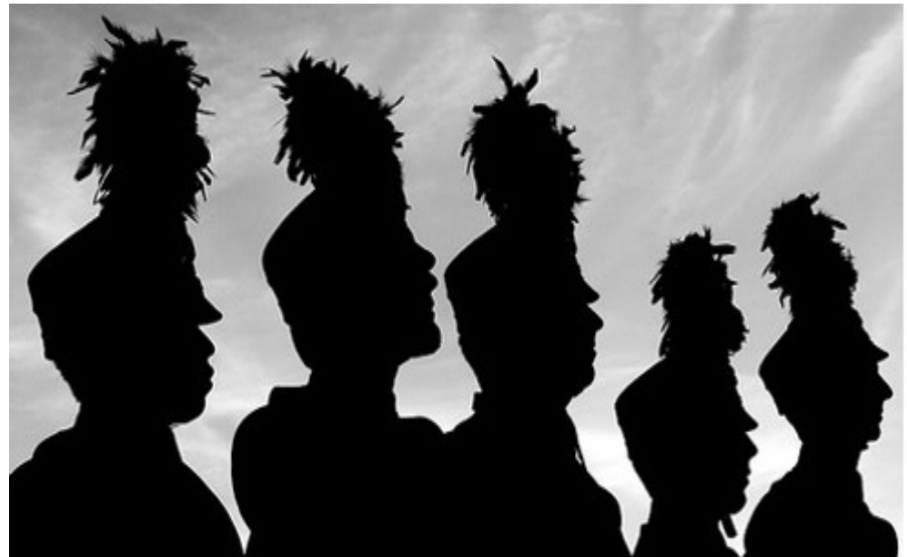
Falcon Mighty, Falcon Pride

The Firelands Band Boosters would like to send out their heartfelt congratulations to the Mighty Falcon Marching Band Class of 2019 on their graduation from Firelands High School! We are proud of you and all of your accomplishments!